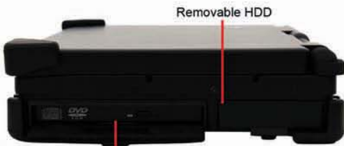
Swappable Component Module Bay - DVD-RW - 2nd Li-on Battery