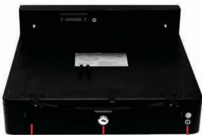
Docking Station Security Lock Power Button