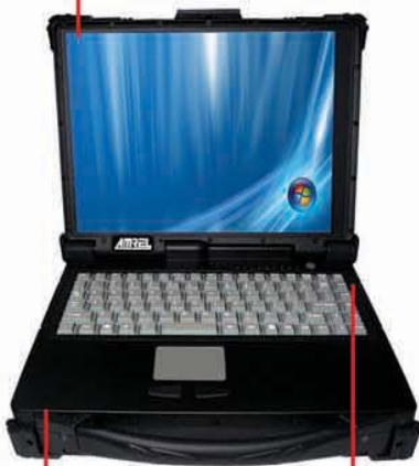
Magnesium Case Integrated Speakers