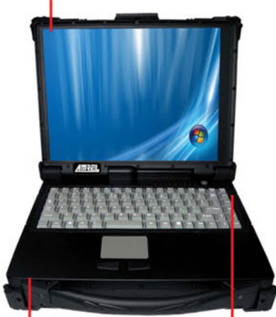
Magnesium Case Integrated Speakers