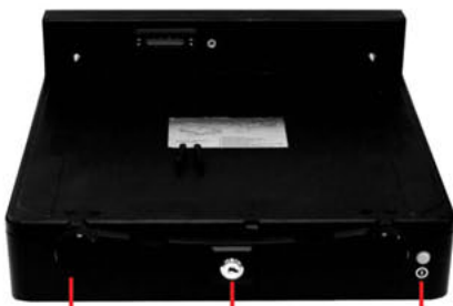
Docking Station Security Lock Power Button