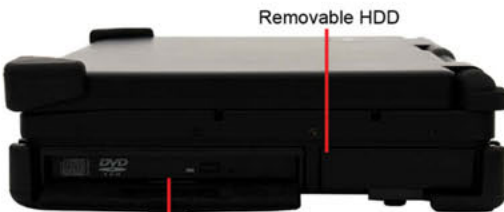
Removable HDD Swappable Component Module Bay - DVD-RW - 2nd Li-on Battery