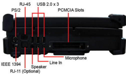
RJ-45 USB 2.0 x 3 PCMCIA Slots PS/2 IEEE 1394 Speaker RJ-11 (Optional) Line In Microphone